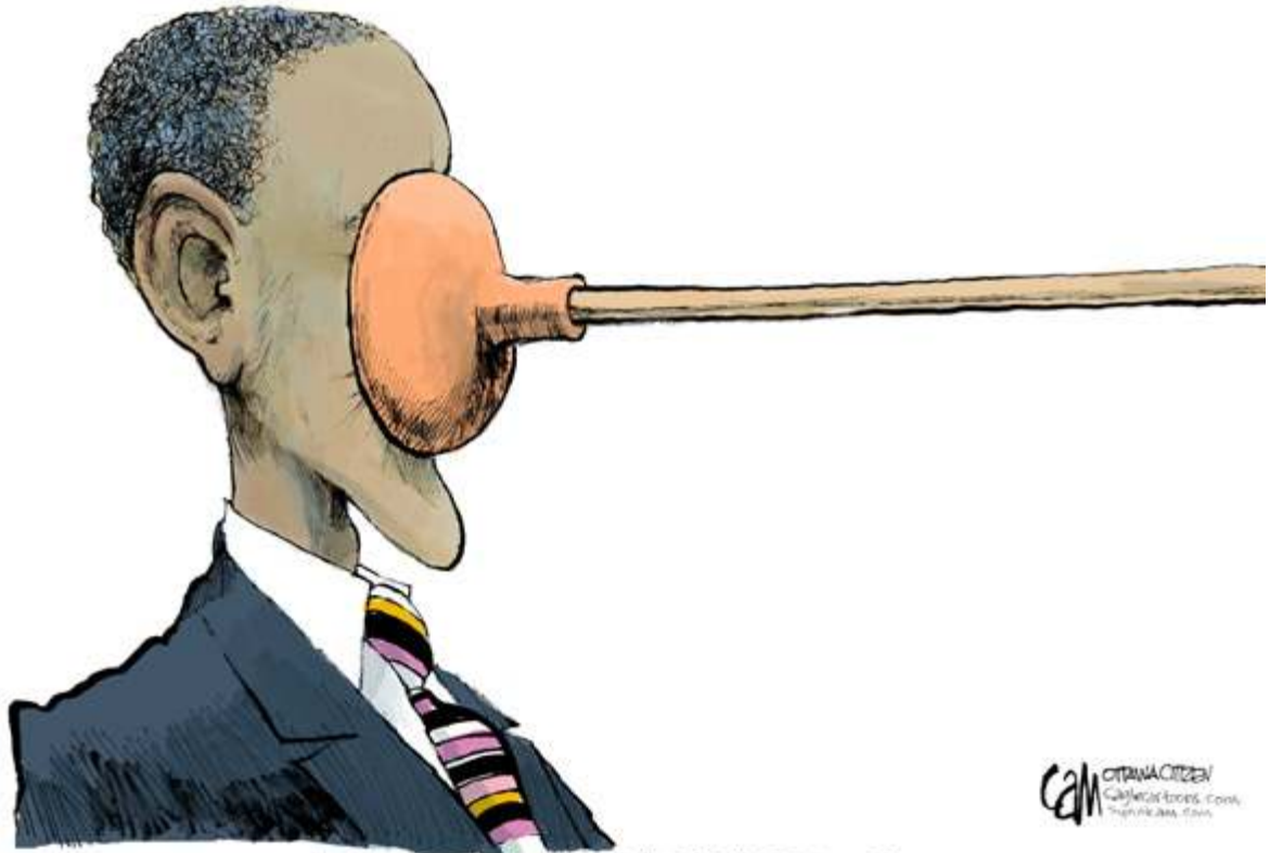
BARACK OBAMA MEETS JOE THE PLUMBER

people said "Sock it to them!" "And redistribute their wealth." And the people said, "Show us the money!" And the he said, "redistribution of wealth is good for everybody."